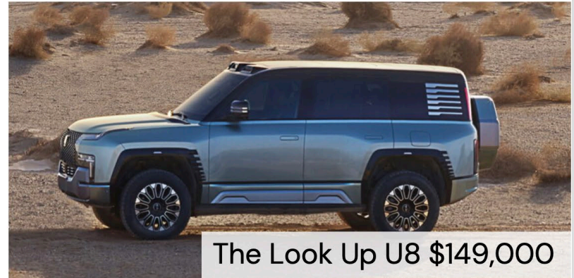
The Look Up U8 $149,000

BYD built 3 million cars in 2023, 34% of China's EV production