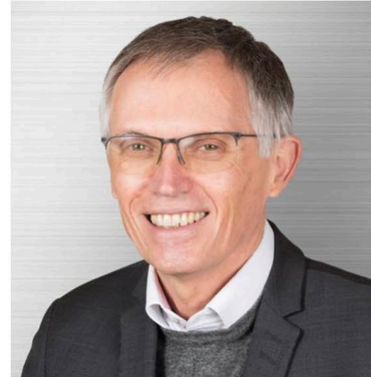
Oliver Zipse CEO, BMW

"There will be a terrible fight with the Chinese"