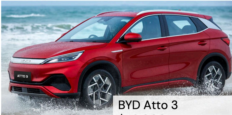
BYD Atto 3