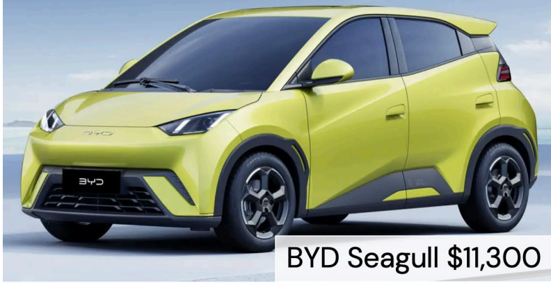
BYD Seagull $11,300